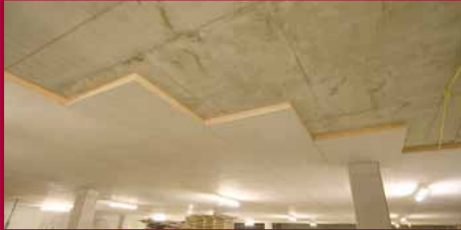
Promat provided over 1500m 2 of Promat TL Board® for thermal upgrading of the underground car park