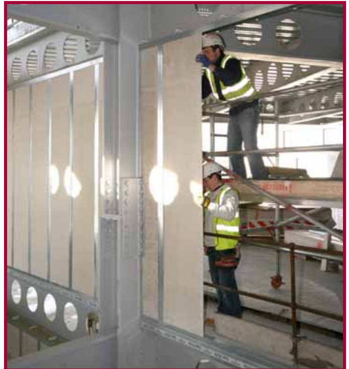
Promat SUPALUX® Shaftwall system provides up to 120 minutes fire protection